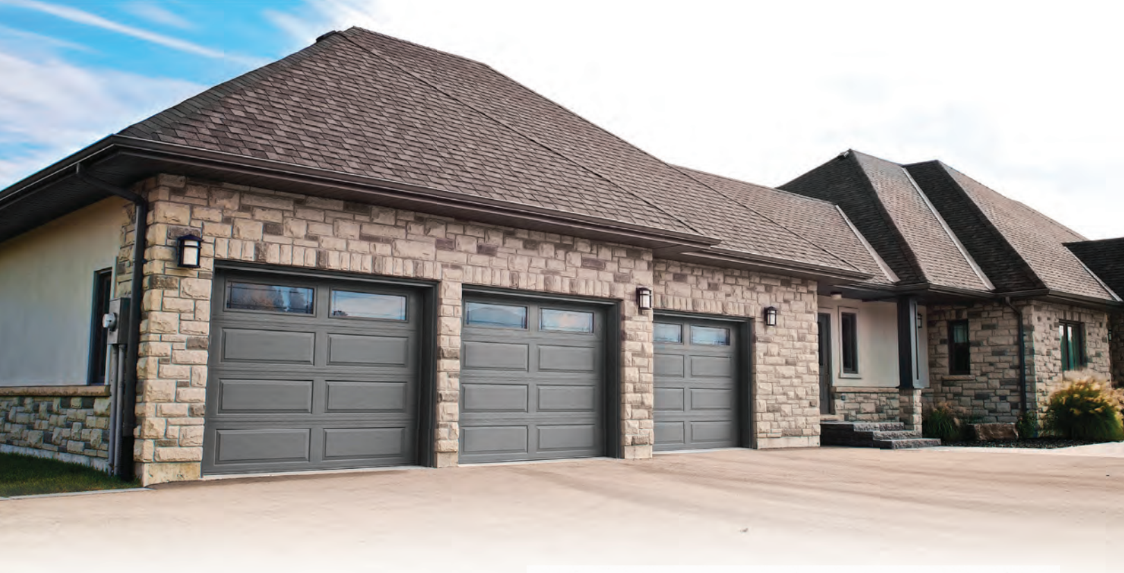
Premium • Raised Ranch • Slate Grey • Black Square Bar Windows • Obscure Glass