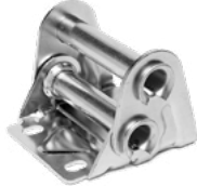
12 GA Roller Brackets