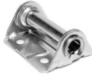
14 GA Roller Bracket