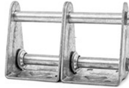
Double Roller Bracket Assembly