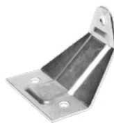
ICB Intern Cross Brace