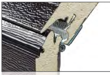
Section joints have a dual seal, ensuring a tight fit and reducing air flow.