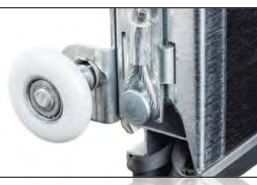
Tamper-resistant cable attachment cannot be released under tension, helping to prevent accidental injury.

For additional features and benefits, talk to your Authorized Dealer or visit www.rwdoors.com