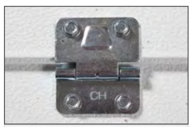
Patented commercial-grade linear-type hinges have the highest strength-to-weight ratio in the industry.